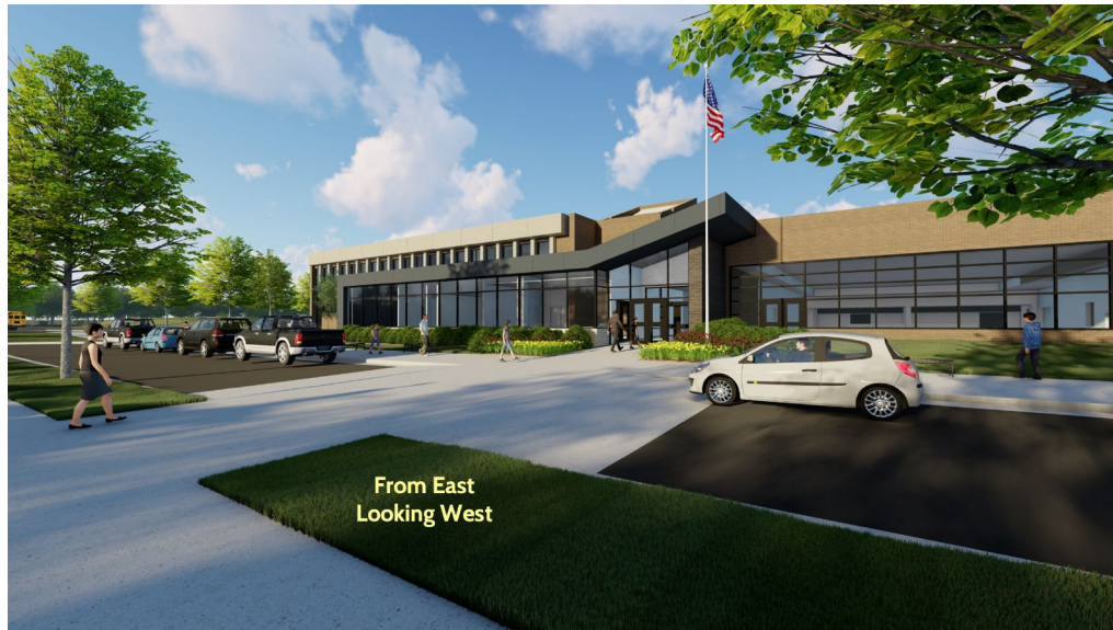
From East Looking West

A new administrative office area will be constructed near the main entry, and the main entry will be updated to create a secure entrance. The kitchen, serving area, and cafeteria will be remodeled. The gym will be enlarged, allowing for increased use for physical education, interscholastic athletics, and community recreation activities.