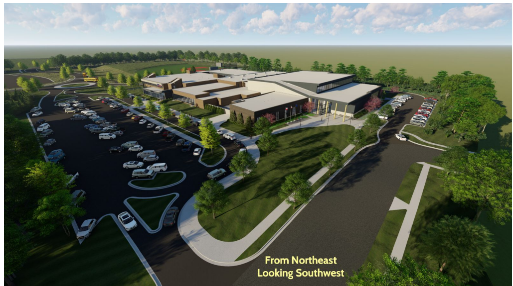
From Northeast Looking Southwest

A new, bigger parking lot for parents and staff is being built on the East side of Beagle, and it has been designed to improve traffic flow for student drop-off and pickup. Buses will drop students off and pick them up on the West side of Beagle, so busses will not be a part of traffic in the parent/staff parking lot.