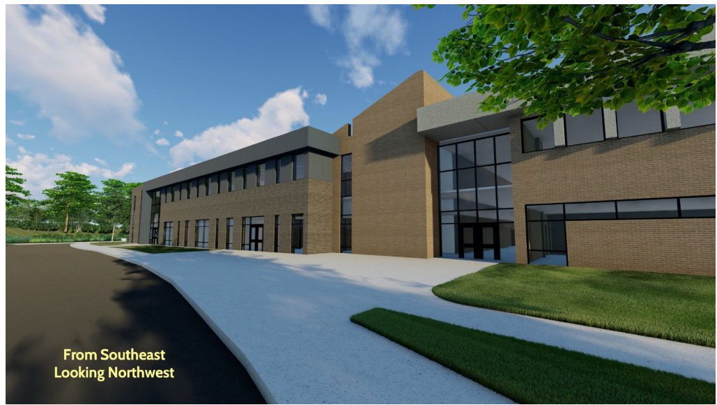
From Southeast Looking Northwest

Beagle is being redesigned to be a 7-8 middle school to fit with the district's restructuring initiative which is planned to begin in the 2021-2022 school year. There will be 16 classrooms added to Beagle: a two-story, 14-classroom wing will be added to the Southwest corner of Beagle next to the existing classrooms, and two specialized music classrooms for band and choir will be added to the Northeast corner of Beagle as a small wing.